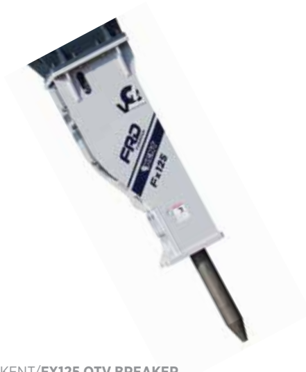
KENT/FX125 QTV BREAKER