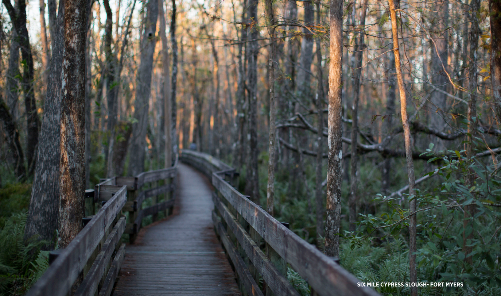
SIX MILE CYPRESS SLOUGH - FORT MYERS