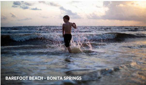
BAREFOOT BEACH - BONITA SPRINGS